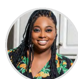
Loryn Wellman Generational Wealth Conference

" Exhibitors were able to collect leads onsite straight from their phones. They didn't have to bring a barcode scanner, they didn't have to use paper. [With Whova], they were able to collect information immediately via QR code."