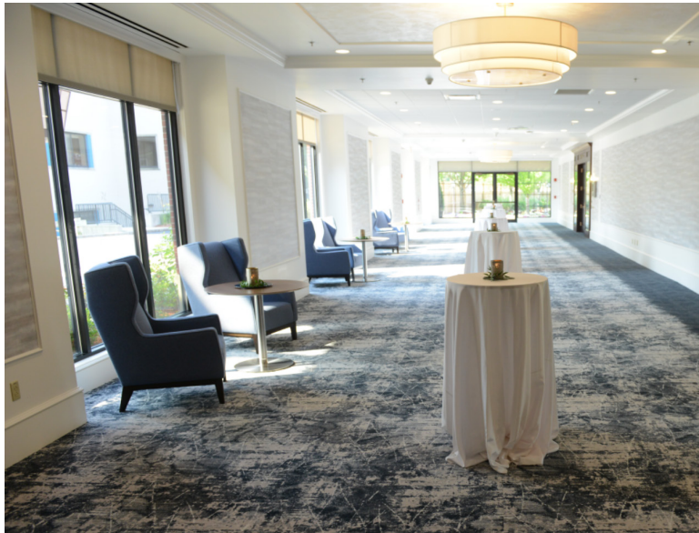
Exhibitor Hall Floor