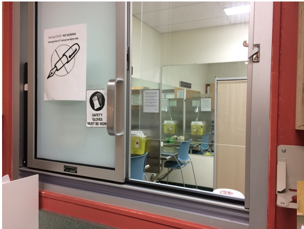
Pass-thru Window between iOAT Clinic and Pharmacy Downtown Community Health Centre