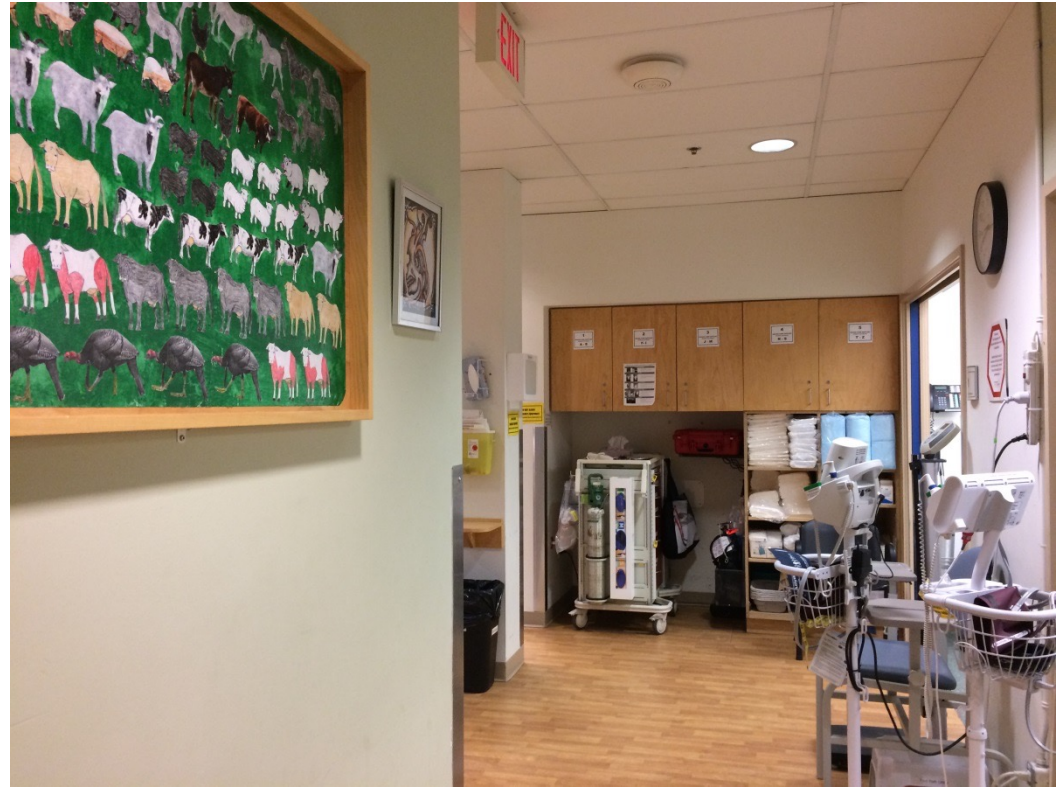
Primary Care Treatment Areas Downtown Community Health Centre