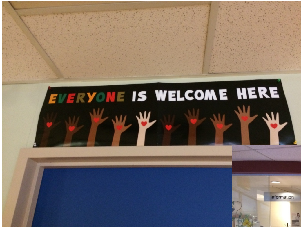
Main Reception Area Downtown Community Health Centre